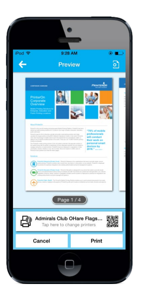
Print Preview View documents before printing, choose number of copies and pages