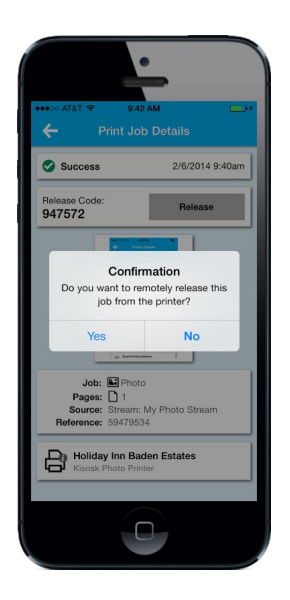
Remote Release Releasing documents directly from the app provides a fluid workflow

www.printeron.com/enterprise www.printeron.com/apps