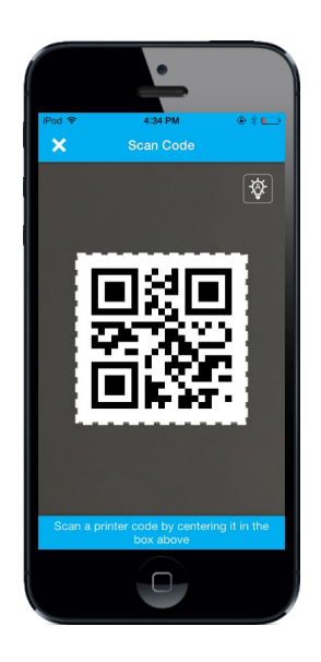
QR Codes Scan QR code on printer to get printer details and save to your favorites