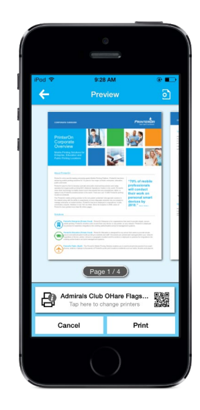
Print Preview View documents before printing, choose number of copies and pages