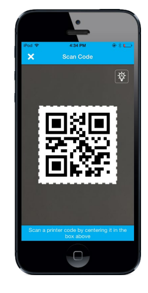
QR Codes Scan QR code on printer to get printer details and save to your favorites