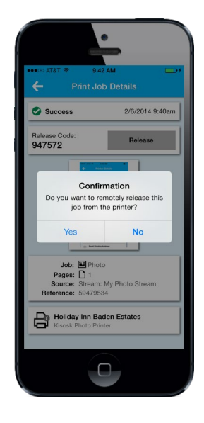
Remote Release Releasing documents directly from the app provides a fluid workflow