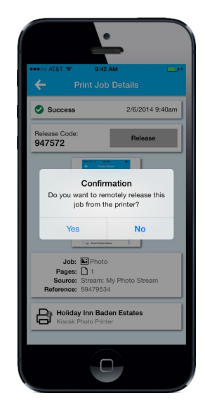
Remote Release Releasing documents directly from the app provides a fluid workflow

© 2014 PrinterOn Inc. The information contained herein is subject to change without notice. PrinterOn and the PrinterOn logo are registered trademarks of PrinterOn Inc. Other trademarks are the property of their respective owners. LIBRARY 04/14