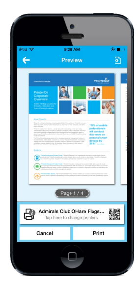
Print Preview View documents before printing, choose number of copies and pages